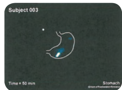
DRcaps capsule starts to release the contents